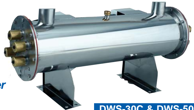
DWS-30C & DWS-50C