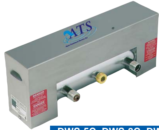
DWS-5C, DWS-8C, DWS-15C