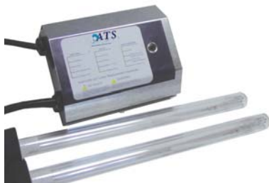
ECONOMY & PROFESSIONAL

* Square foot coverage numbers are listed with a built in safety margin to accommodate houses with a higher than normal rated capacity HVAC system for total scfm based on total square footage. In a house with a higher scfm HVAC rating unit per sq. footage, we would then have a tendency to size an Air UV within the minimum safety margin square footage coverage. A house with a standard sized HVAC scfm unit per sq. footage could go to the maximum capacity coverage of the UV Air unit.