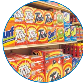
Use Less Soaps and Detergents