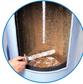
Save on Plumbing Fixtures & Repairs