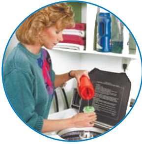
Softer, Fluffier Clothes