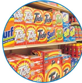
Use Less Soaps and Detergents