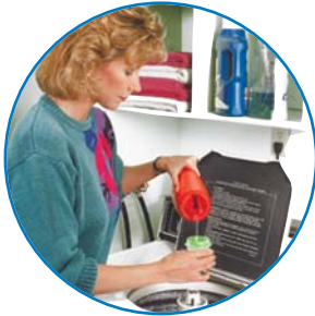
Softer, Fluffier Clothes