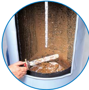
Save on Plumbing Fixtures & Repairs