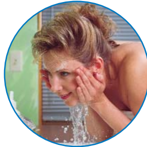
Skin stays naturally smooth; hair silky clean