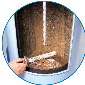
Save on Plumbing Fixtures & Repairs