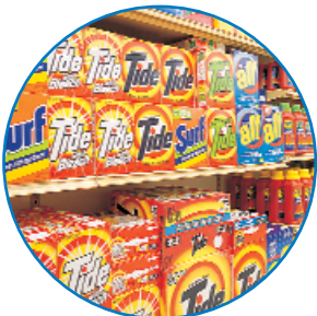
Use Less Soaps and Detergents