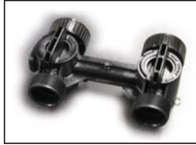
1256 Noryl Bypass is included