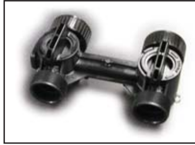
1256 Noryl Bypass is included