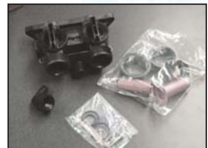
256 Noryl Bypass is included