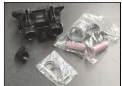
256 Noryl Bypass is included